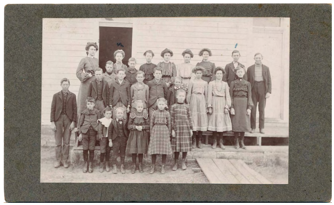
Figure 3-6. Country school picture in Drury, Kansas, c. 1901 (8 x 4¾).